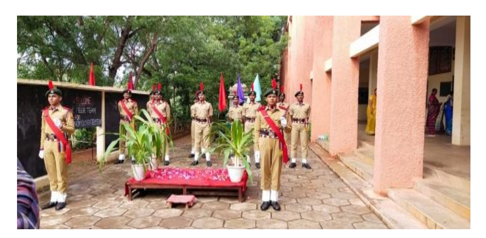
INDENPENDENCE DAY GUARD OF HONOUR HELD ON 15th AUG 2021