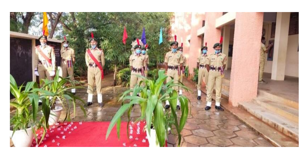
A O VISIT SIR AT OUR COLLEGE 8 DEC 2021