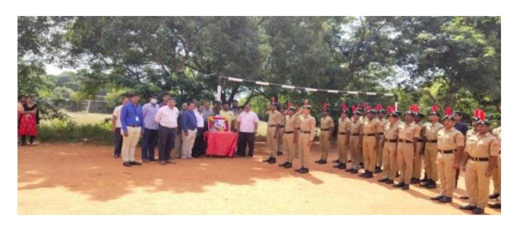
ARMY CHEIF GENERAL TRIBUTES AT OUR COLLEGE HELD AT 10<sup>th</sup> DEC 2021